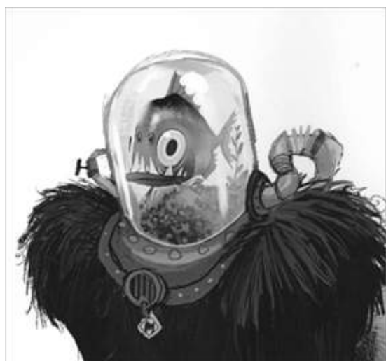
Minion Development Drawing

154. The Kingfish character has hoses attached to the circular hose attachments on the side of the fish bowl. An early drawing of Minion also featured the “hoses” attached to the fish bowl, including the segmented design of the hoses. The final version of Minion did not include the hoses.