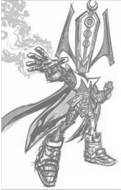
Early Megamind Design