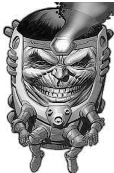
Modok, Jack Kirby